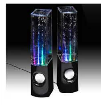
Quantum Tower Speakers with Dancing