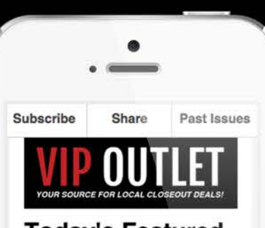
Today's Featured Items